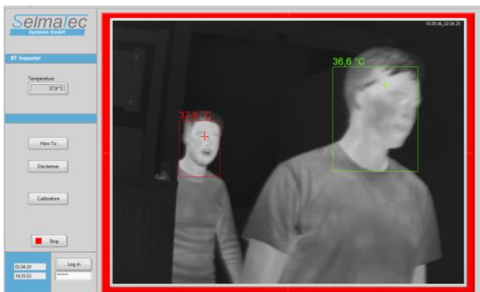
ALARM WITH HIGHER BODY TEMPERATURE